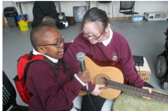
In Rehearsal for the Concert